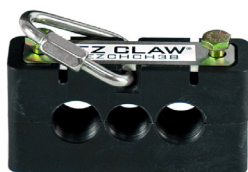
EZ Claw Hose & Cable Block