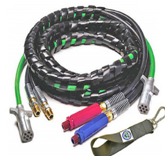
EZ Claw Grote 3-in-1 Harness with Glad Hands & Sling