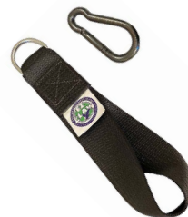
EZ Claw Line Saver Sling